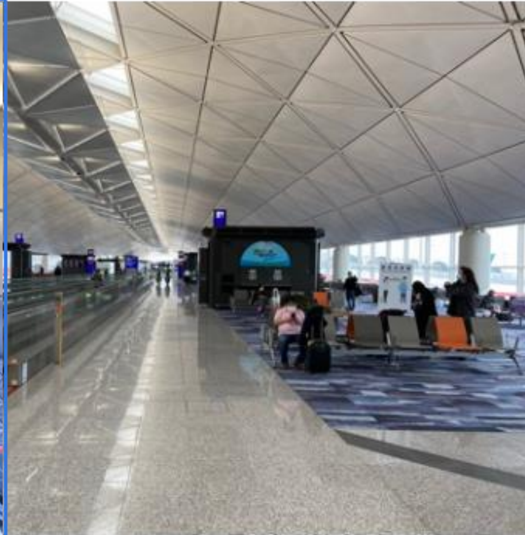
Empty Concourse - Hong Kong