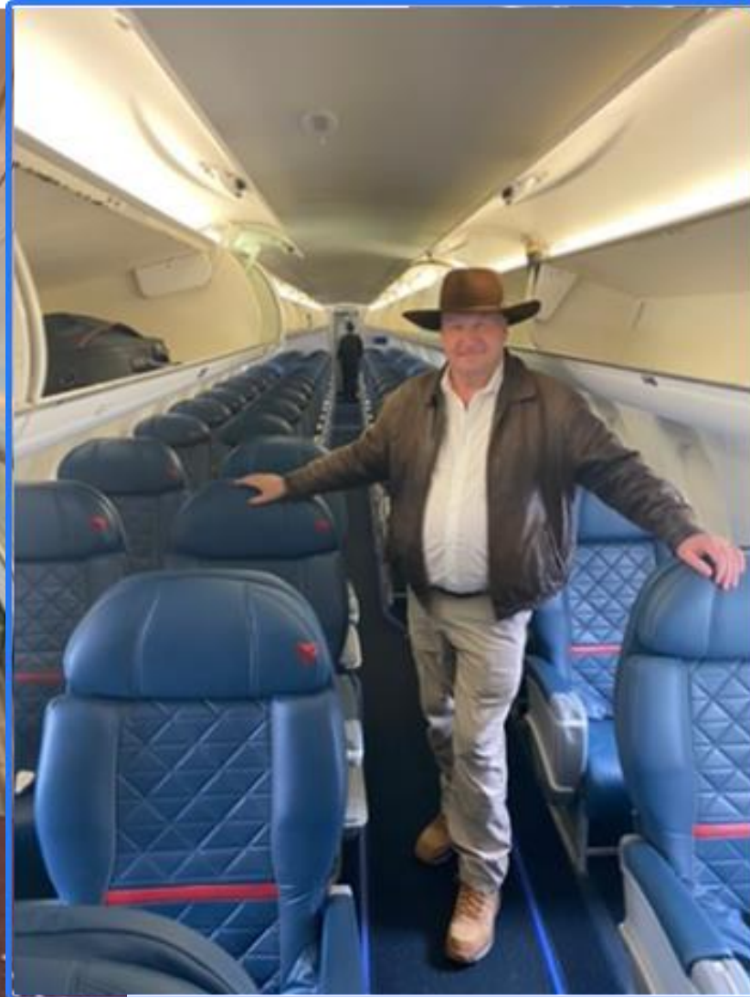
Boarding Empty Delta Flight